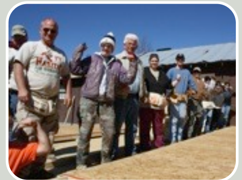
FRIENDS WORKING ON THE PEABODY EXPANSION

May 13th - 16th is a long weekend dedicated to prepping Camp Baker Mountain for the summer. In the past, this weekend was offered to Former Staff looking for a way to serve the camp home they know and love. This year, we have revamped that weekend to include anyone willing to help us get Baker ready for the summer. Specifically, we need a group of people willing to clean cabins, paint, weed eat, wipe down mattresses and sweep. We also need a group of people with specific construction skills to help install ventilation in the dining hall. We will be putting a whole house attic fan, vents, closing in two gable ends, and installing mini blinds. We are hoping that those people who live in a two - three hour radius can help us out, even if it is just for one day. Remember, this weekend is FREE, and includes meals and lodging!