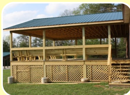
NEW FELLOWSHIP PORCH