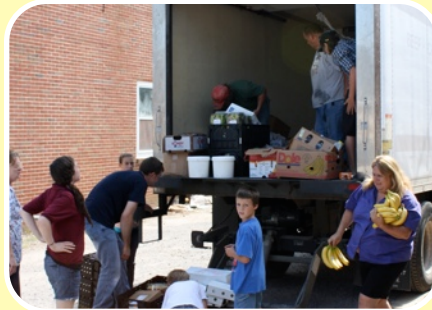
GRUNDY COUNTY FOOD BANK DISTRIBUTION