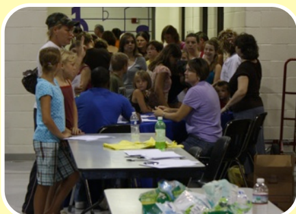
HUNDREDS OF YOUTH AT THE BACK-TO-SCHOOL BASH