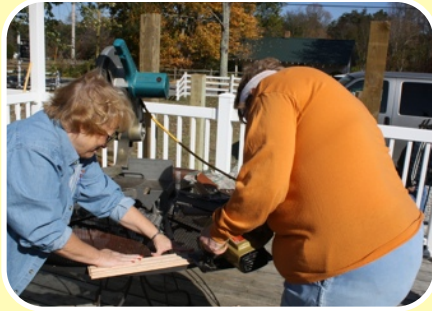
AIM VOLUNTEERS WORKING ON THE CLINIC