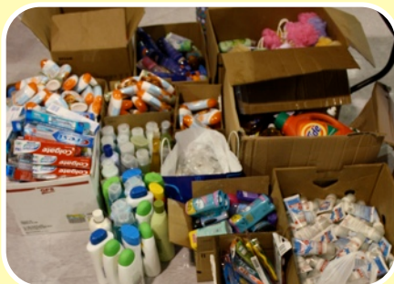
BOXES OF EXTENDING THE PARTNERSHIP SUPPLIES