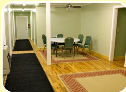
NEW PEABODY RENOVATIONS